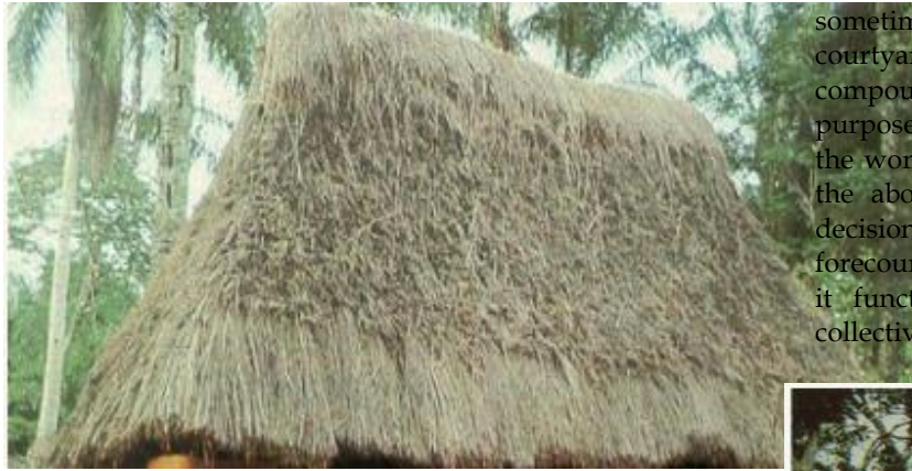
Plate 2: A typical thatch roof