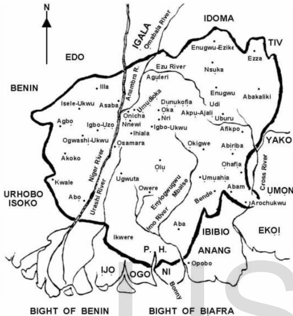
Fig. 1: Map of Igboland in Nigeria

country. Administrative, it is made up of the entire Omambala (Anambra), Abia, Ebonyi, Enugu and Imo states, parts of Delta and River State [4]. The Igbo are surrounded by the Edo to the west, the Ijo, Urhobo and Isoko to the south and south west. To the east are the Efik/Ibibio groups and to the north are the Igala, Idoma and Tiv.