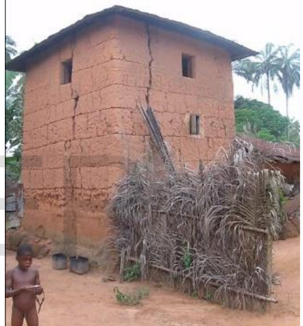
Plate 1: A typical mud house

Mud is the basic material that Igbo traditional builders use in constructing their houses. Mud as a building material is usually a mixture of clay, sand and silt. The clay content determines its structural strength, cohesiveness and plasticity while its sand content provides resistance to abrasion and water damage [9]. It is used for foundations, floors, walls and sometimes roof. Mud is used in varying thickness and is sometimes reinforced with timber. It is also known as earth or Adobe.